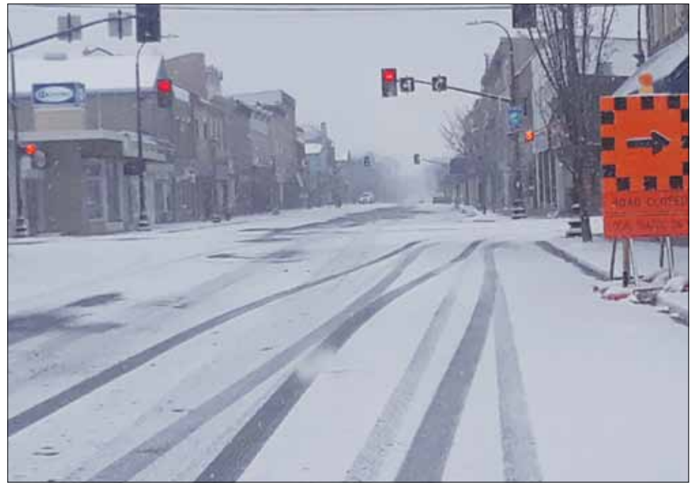
One last blast of winter hit Kincardine the morning of April 15. Sanders and sidewalk plows could be seen on the streets before 9 a.m. Bright sunshine melted most of the snow by the end of the day.